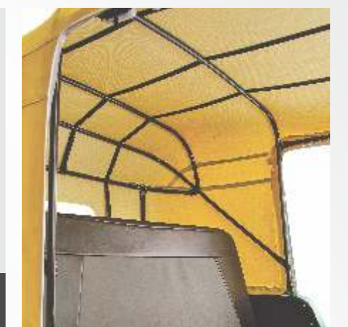
Robust Hood Structure