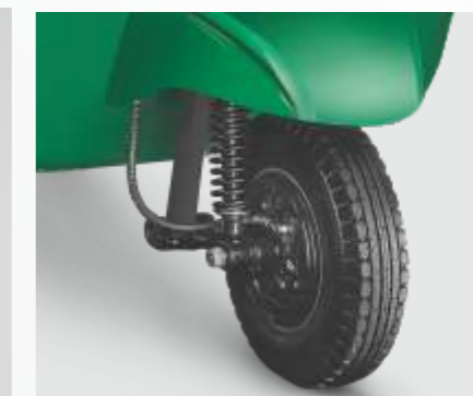
Anti-Dive Shock Absorbers & Solid Suspension