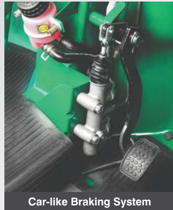
Car-like Braking System

10 to 12 hours of driving is a daily routine for you. Heavy traffic, constant clutching and braking result into pain in ankles and physical fatigue. But now you can put an end to this everyday misery. Ape City promises comfortable and pleasant drive with a perfectly positioned inclined driver seat. It offers more headroom and a broader view with an extra-wide windshield. Car-like braking system and smoother clutch take care of all your worries. It offers a well-cushioned and broad passenger seat. Go ahead, begin a journey of comfortable drives for you and your esteemed passengers.