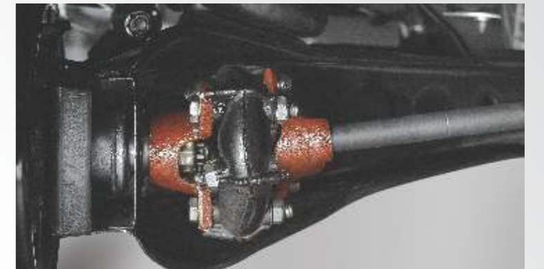
Maintenance-Free Flexible Coupling