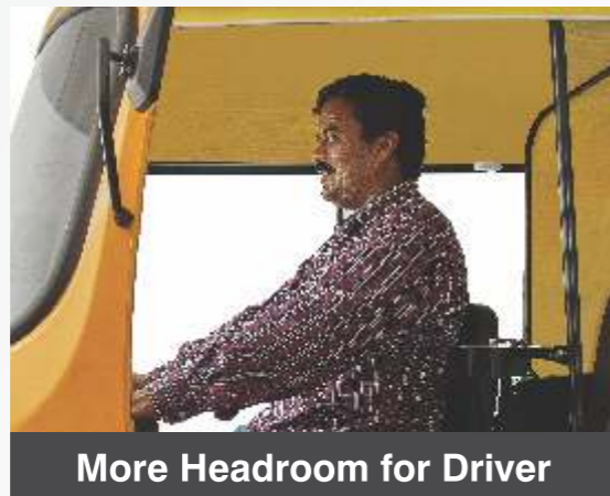
More Headroom for Driver