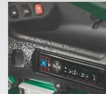
Provision for Music System

Ape City makes you stand out from the rest with a stunning Italian Design. As you step in, a stylish dashboard reveals its smartness quotient. It steals your heart with an exciting range of features like Italian Speedometer, Mobile Charger, Provision for Music System & Speakers and Coin Holder. Stylish Bumper and Clear Transparent Headlamps make the drive even more exciting. Move on, let the style with stunning smart features make you stand out amongst your peers.