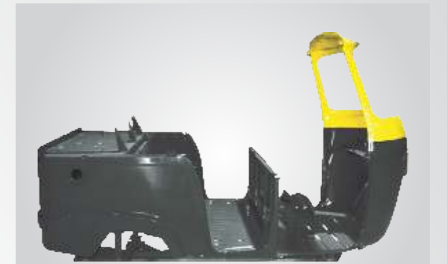
Strong Metal Sheet

Reaching destinations on-time on bad roads is itself a huge task. Bad roads affect the performance and life span of a 3 Wheeler. But the brand new Ape City ensures a smart drive even on bad roads. It features a truly Strong Body, loaded with Monocoque Chassis and a robust Metal Sheet for a safer drive. Better Suspension and Solid Shock Absorbers promise a super smooth and comfortable driving experience. It won't ask for frequent greasing due to maintenance-free Flexible Couplings. It will save your time and money. Come and experience a smart drive with the New Ape City.