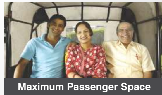
Maximum Passenger Space