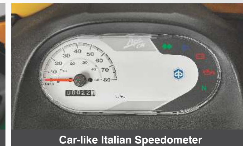
Car-like Italian Speedometer