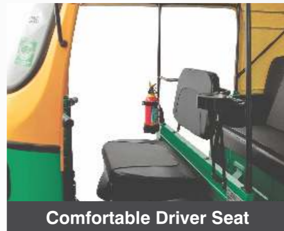
Comfortable Driver Seat