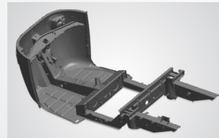
Strong Monocoque Chassis