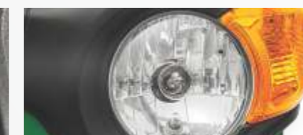
Clear Transparent Headlamp